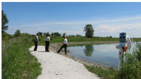
VC Fishing Access

Because of your support, Friends of Ottawa National Wildlife Refuge is pleased to share progress updates on three public use projects: the Visitor Center Fishing Access, West Harbor Landing, and the Ottawa Wildlife Drive.