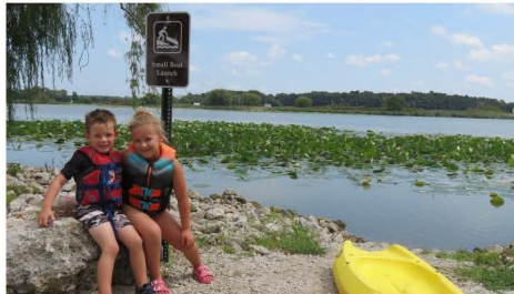
West Harbor Landing