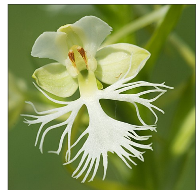
Eastern Prairie Fringed Orchid is one federally threatened species found at Ottawa NWR.