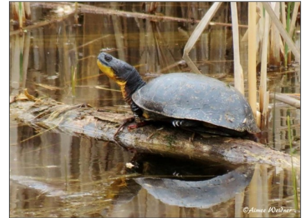
The Blanding's Turtle is a state-threatened reptile found at Ottawa NWR.

This 80 acre island is situated in Lake Erie, about 9 miles from shore. It is the largest Great Blue Heron and Great Egret rookery in the U.S. Great Lakes. Access is by permit only.